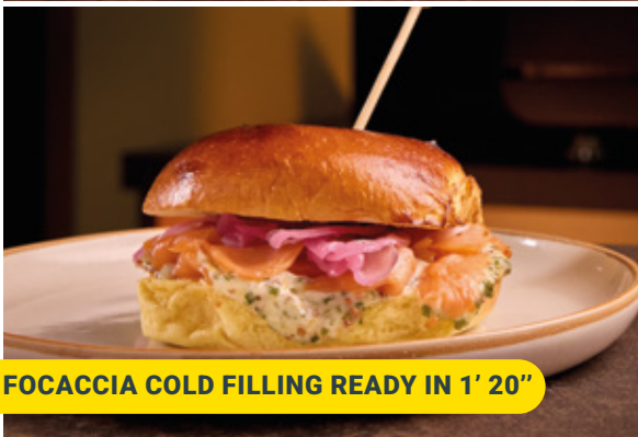
FOCACCIA COLD FILLING READY IN 1' 20"