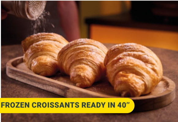
FROZEN CROISSANTS READY IN 40"