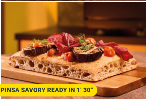
PINSA SAVORY READY IN 1' 30"